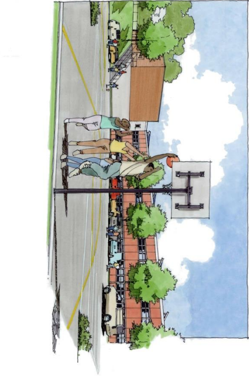
Rear Perspective Rendering

For 50+ years AMPAC has trained plumbers within the seven county region of Pittsburgh. Recently, AMPAC has purchased a new facility to call their permanent home and train future generations of plumbers. We are now in the process of renovating the property. We are building our plumbing community one brick at a time and need your help. Be a part of the biggest open shop plumbing school in PA forever! We are selling opportunity for everyone to have their own spot in the front of the school. Be a part of tomorrow, buy a brick today.